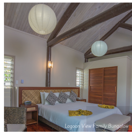
Lagoon View Family Bungalow